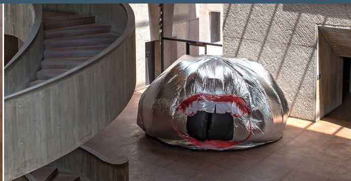
Gallery: Everson Museum presents 'Seen and Heard' exhibition